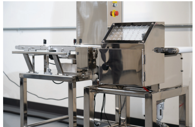
Fully welded frame constructed of heavy gauge 304 stainless steel.